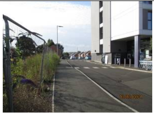
Wilmot Lane – view toward Lacemaker Road, convenience store to the right