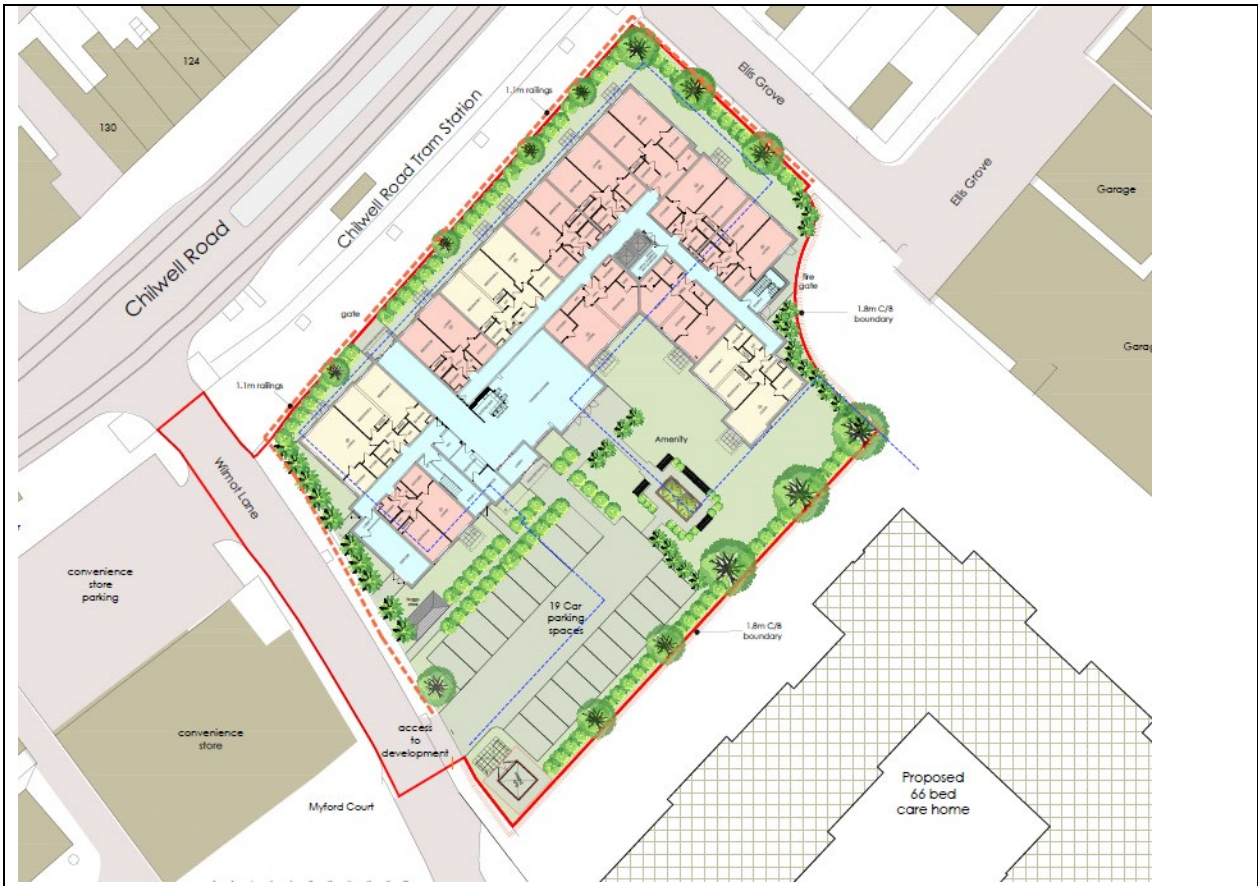
Proposed site plan