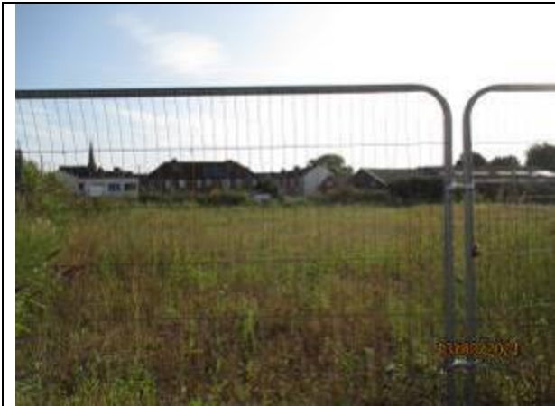
View across the site from Wilmot Lane to Ellis Grove