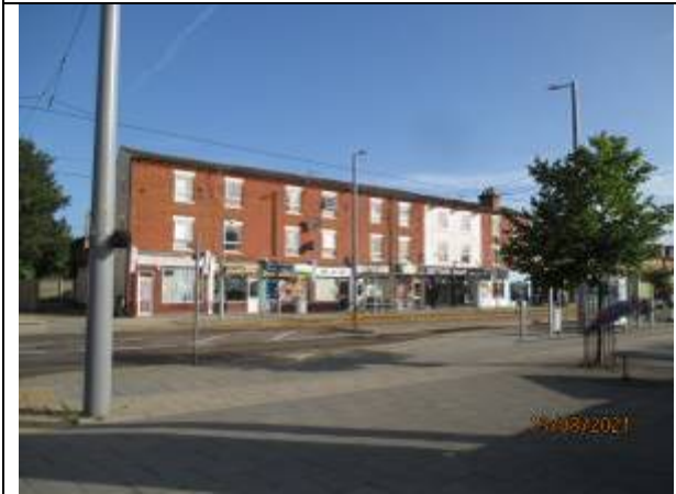
Shops and tram stop to the north west of the site