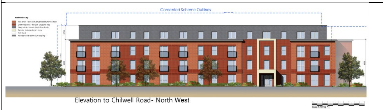
Elevation to Chilwell Road- North West