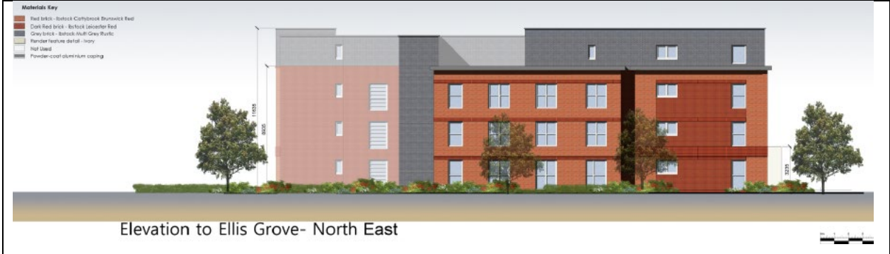
Elevation to Ellis Grove- North East