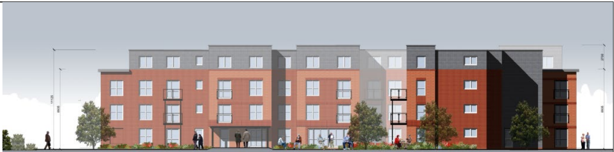
Elevation to Landscaped Garden- South East