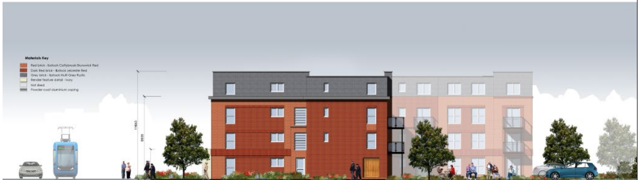
Elevation to Wilmot Lane- South West